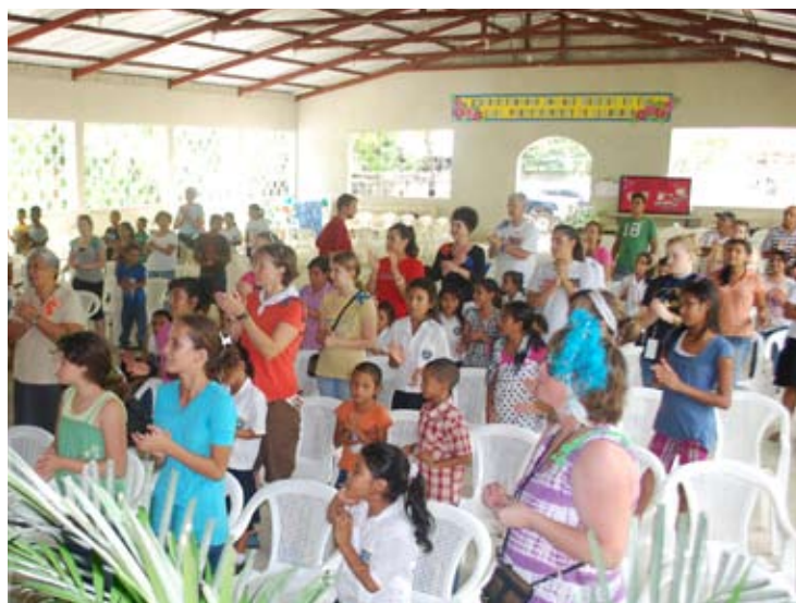
July VBS Team had 130 children singing praises to Jesus at a local church in Tegucigalpa.