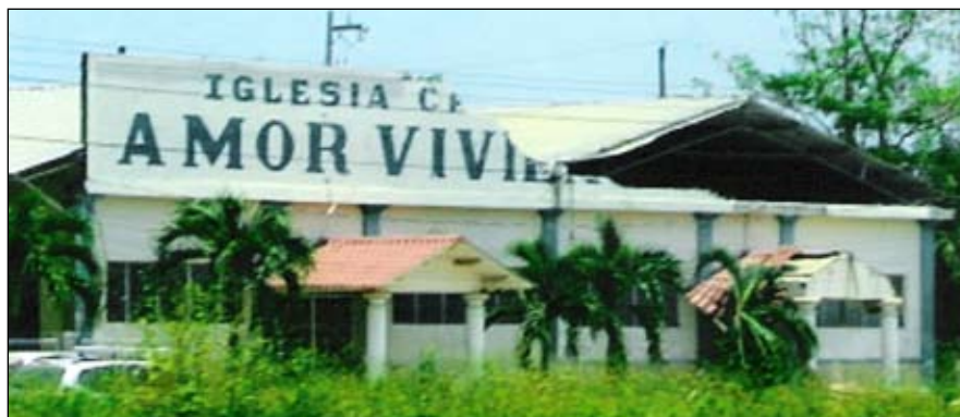
Situated near Roatán off the coast of Honduras, a 7.1 earthquake on May 28th caused minor cracks in buildings in Puerto Cortes and at the Children's Village.

When they came home, I met them at the airport expecting to find