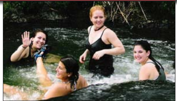
The "Tennessee Girls" enjoy a "shower" in the river after clinic.