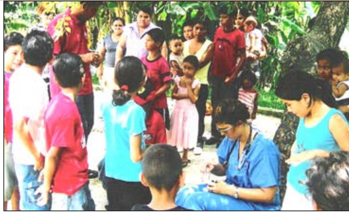
The May medical team saw about 900 people over 3½ days in Las Flores in the mountains.

At the end of May, WWH2H hosted a small med team that went up into the mountains of Santa Barbara,