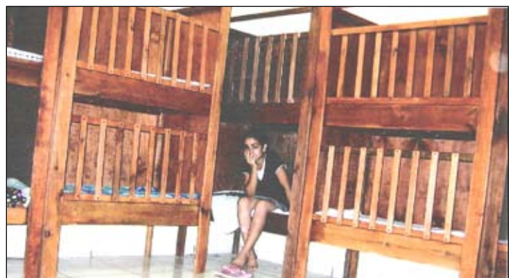
To save floor space, double decker cribs have been made for the babies and toddlers.