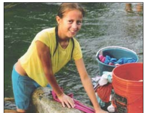
A local girl bathes and washes the family clothes in the river.