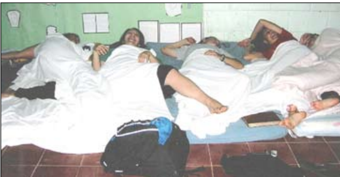
Med team slept on pads in a classroom.