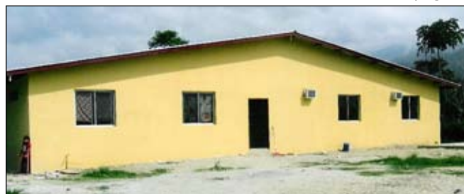
Babies’ House building is now complete.